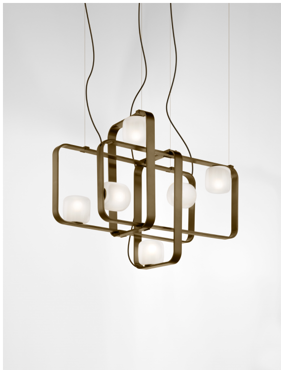
GROOV SP 4 BCSF BR2 E14 CE